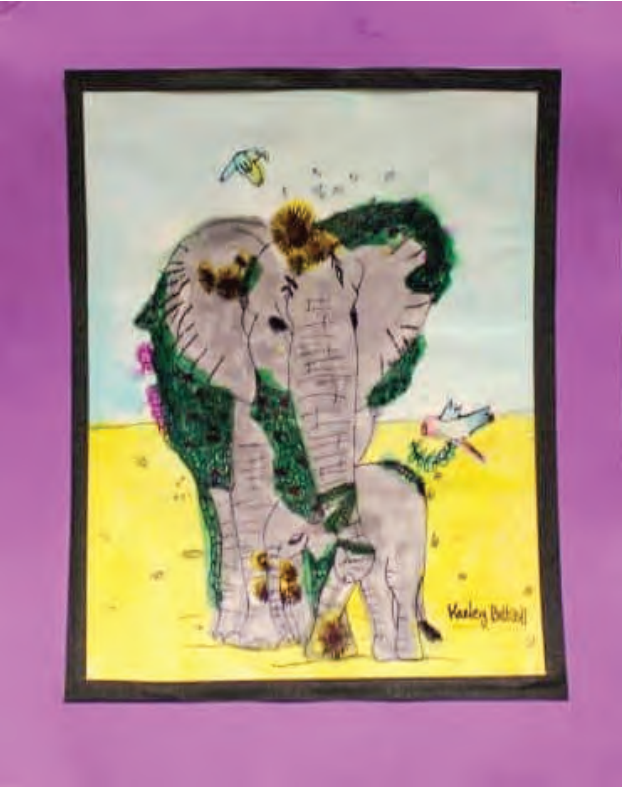
One of the many pieces of art on display during the 2023 Creative Expressions Exhibitions event at Beach Middle School.

continued from page 1 what we do would be possible without the generosity of our donor community for which we will be forever grateful,” said Amy Forehand, CEF President.