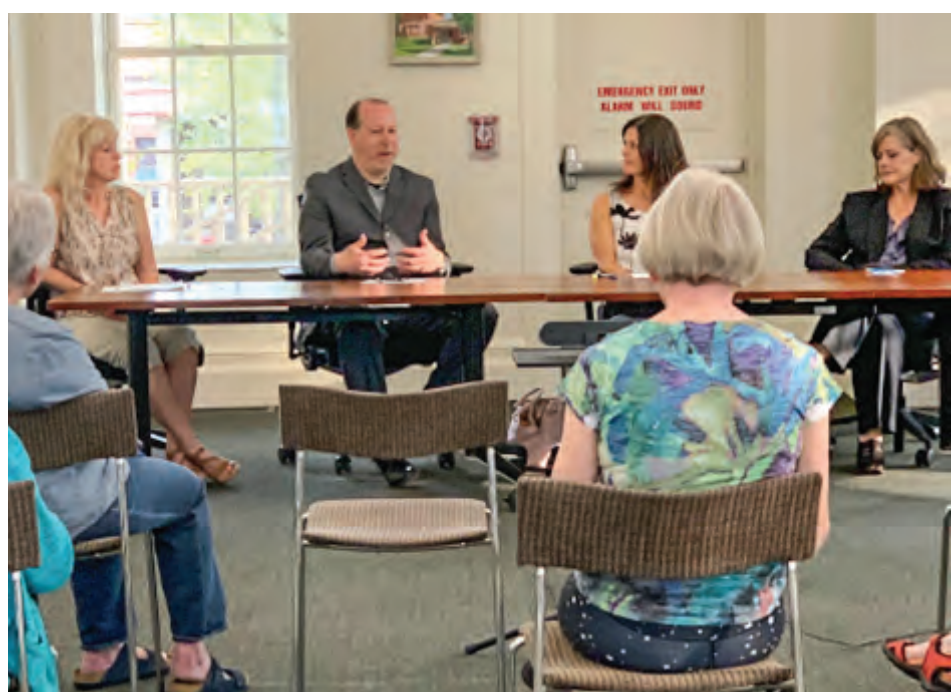
Story on page 9.