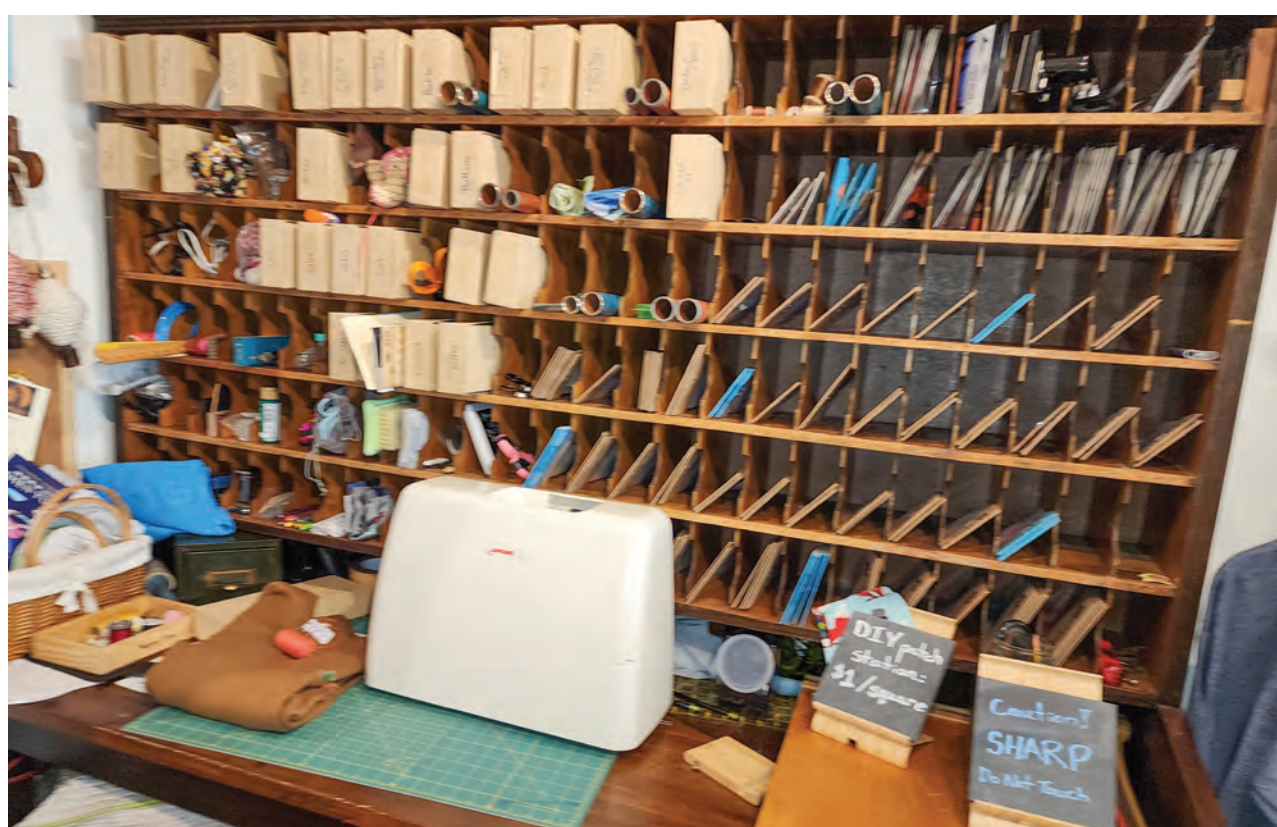
Story and more photos on page 9.