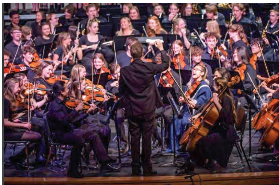
Story on page 8.