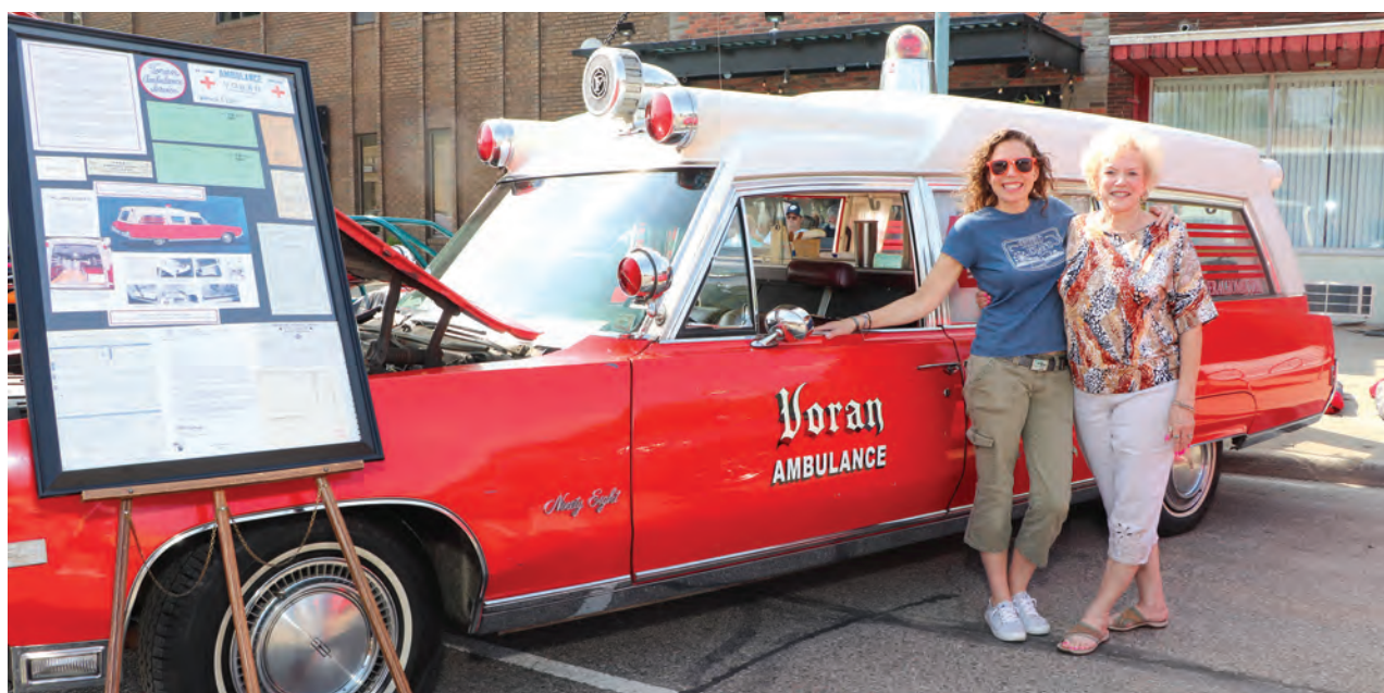
Story and more photos on page 3. Voran Funeral home had their own ambulance in the early days.