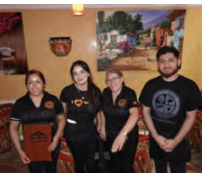
The staff of Los Arcos Restaurant is ready to serve you!