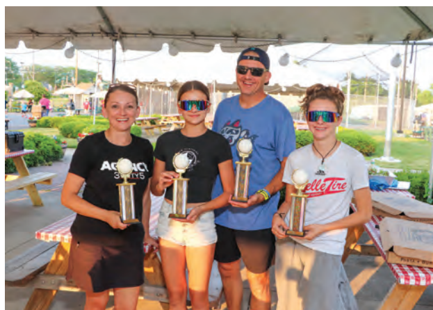
Story and more photos on page 9.