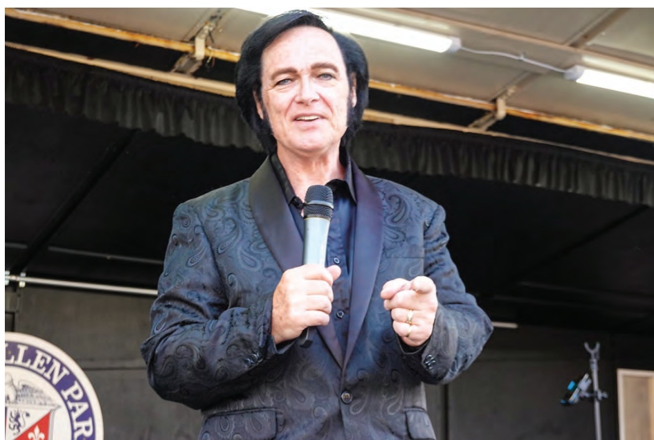
Story and more photos on page 4.