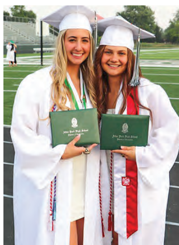
Story and more photos on page 5.