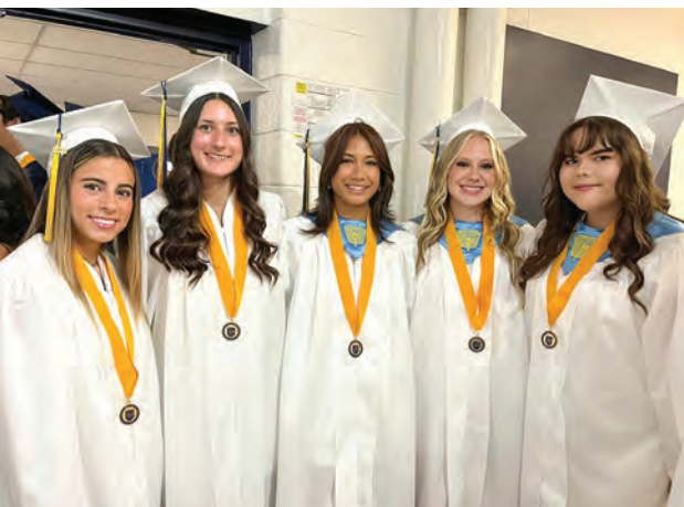
More photos on page 6.