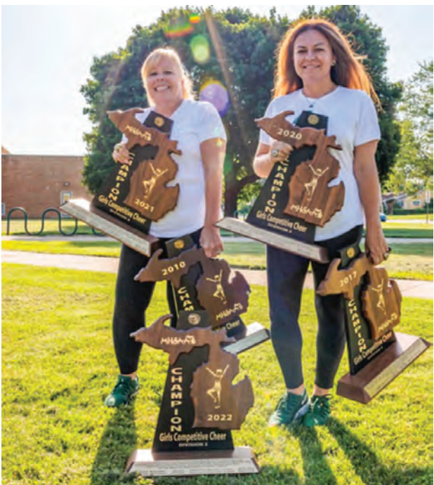
Story on page 10.