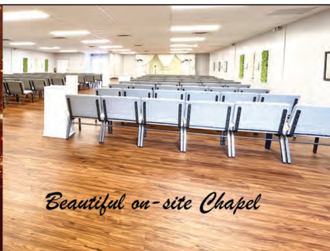
Beautiful on-site Chapel