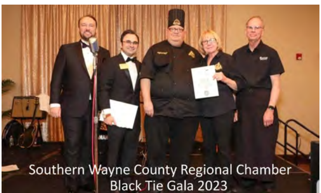
Southern Wayne County Regional Chamber Black Tie Gala 2023