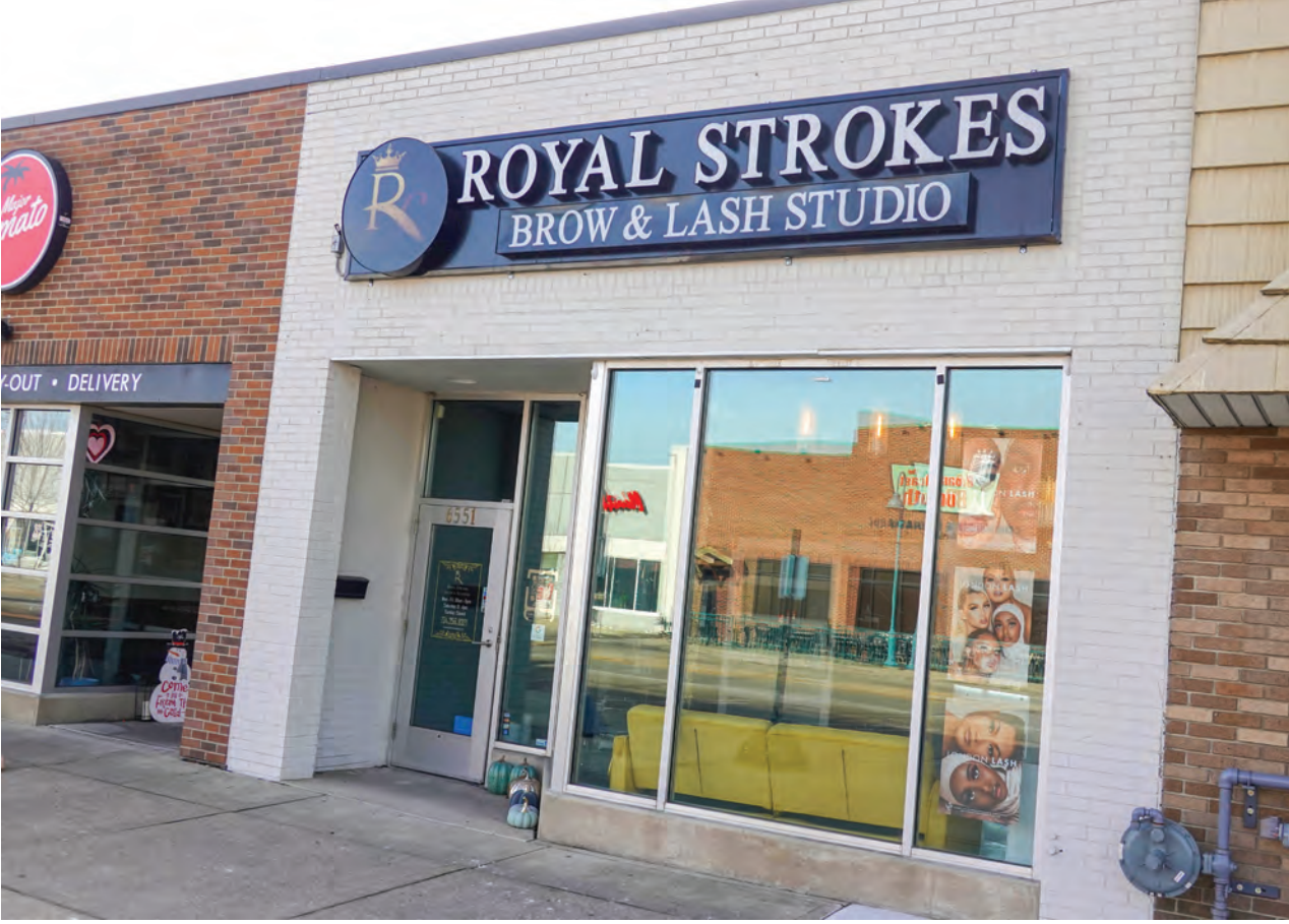
Story on page 8.