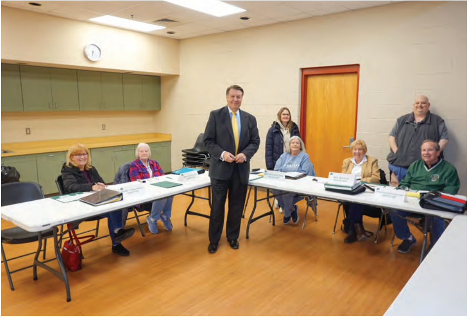
Story on page 10.