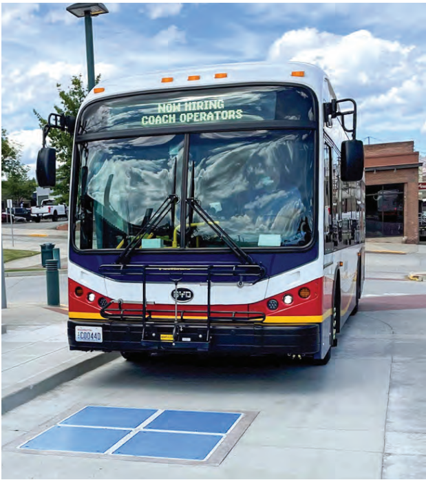
Municipal bus approaching a wireless inductive charging pad.

DMS to Help InductEV Meet the Growing Demand for Wireless Charging from Fleet Owners & Operators and Port and Freight Terminals