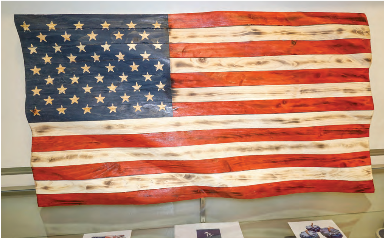
Story and more photos on page 4.