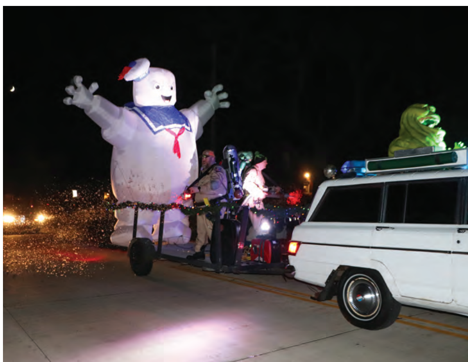
Story and more photos on page 10.