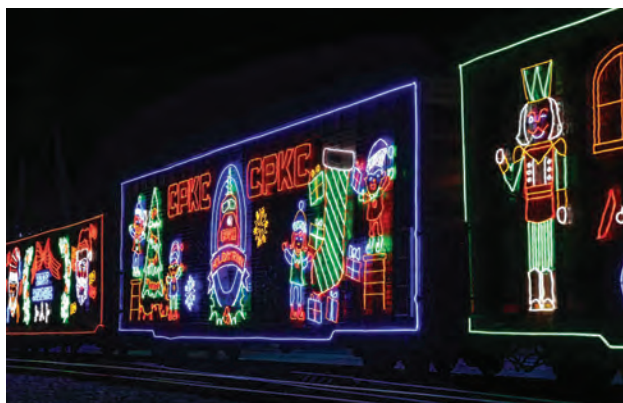
Story and more photos on page 7.