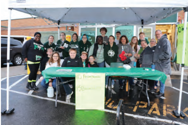
Story and more photos on page 4. The Allen Park Marching Band is ready to serve a pancake breakfast to you.