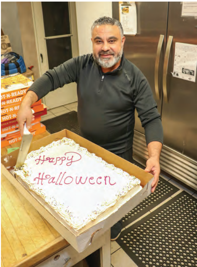
May's Bakery donated the cake to the pumpkin patch party.