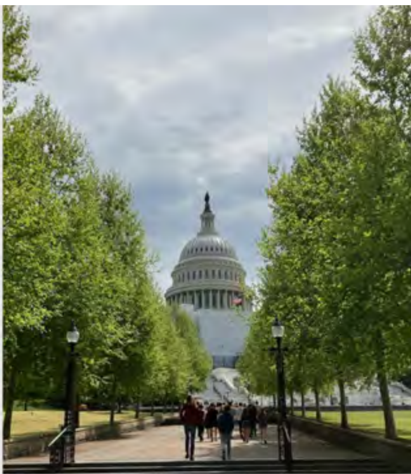
Beach Middle School - Washington D.C. Trip 2023