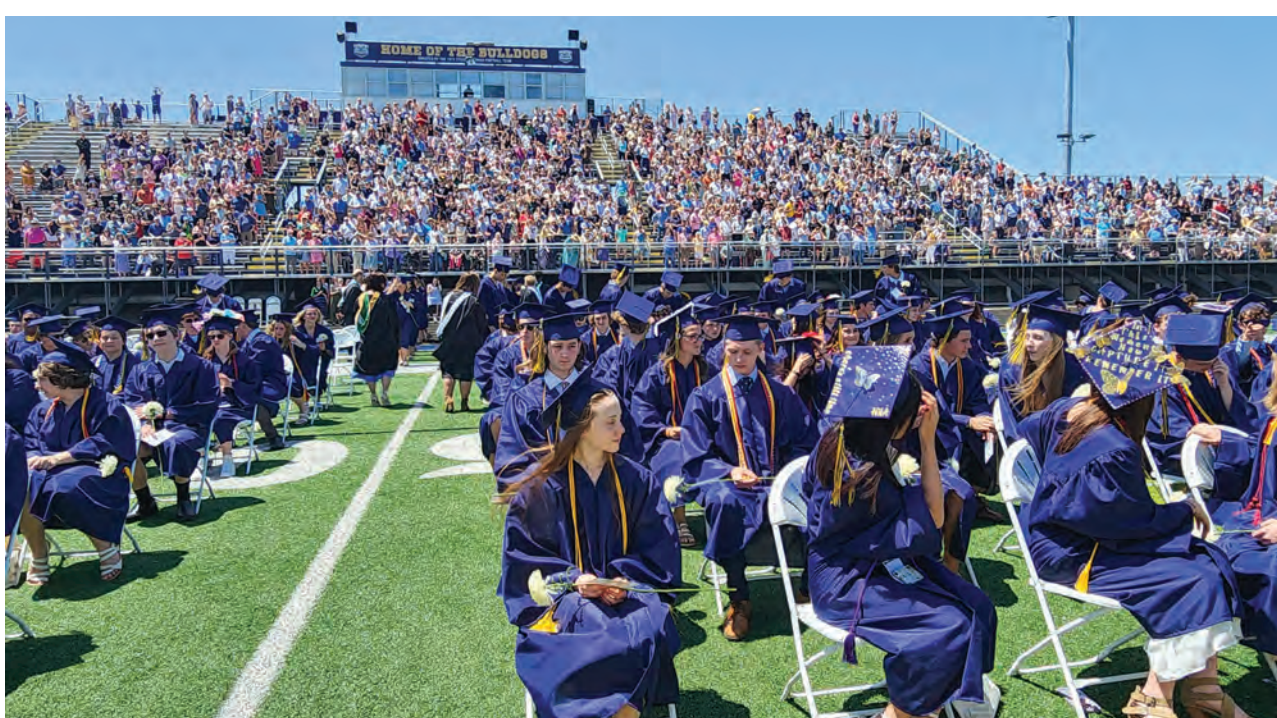
Story and more photos on page 9.