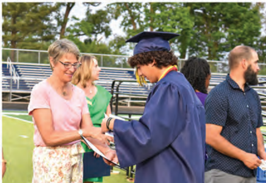
Photos from Chelsea High School Class Night

At this year's June 2 event, CEF's Board members, scholarship sponsors and volunteers congratulated Seniors and handed out $47,100 in 39 individual scholarships. Chelsea Alumni Association, teachers, and administration were also present and participated in the honorary festivities.