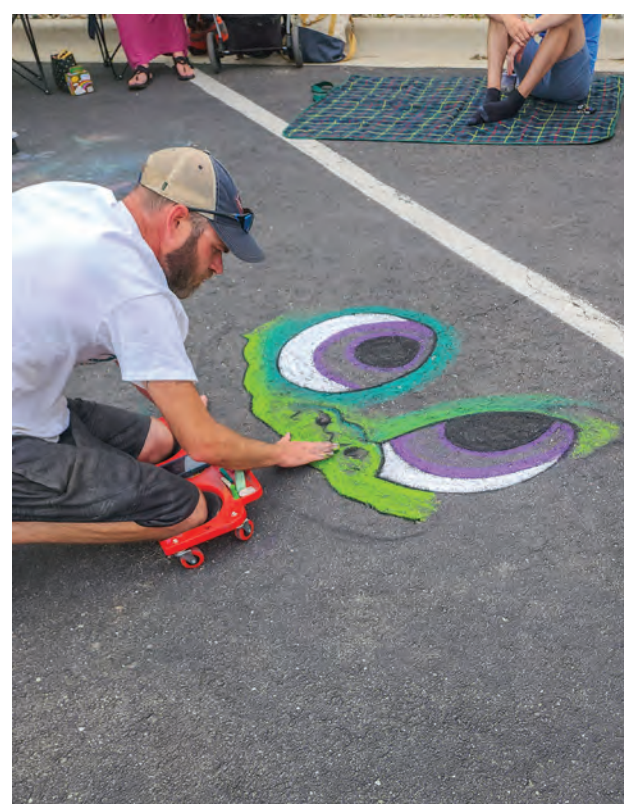
Story and more photos on page 2.