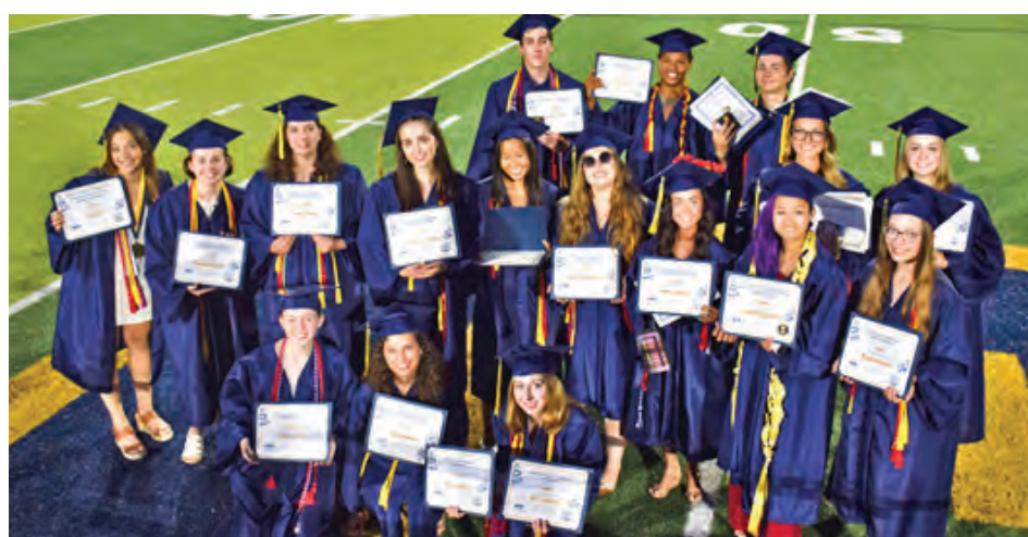
Story and more photos on page 6