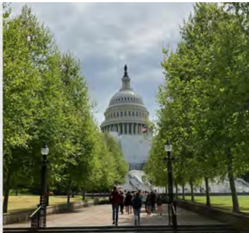
Beach Middle School - Washington D.C. Trip 2023

Chelsea School District educators. These grants funded a wide variety of initiatives at every level of the student experience, including support for the annual Washington D.C. Trip.