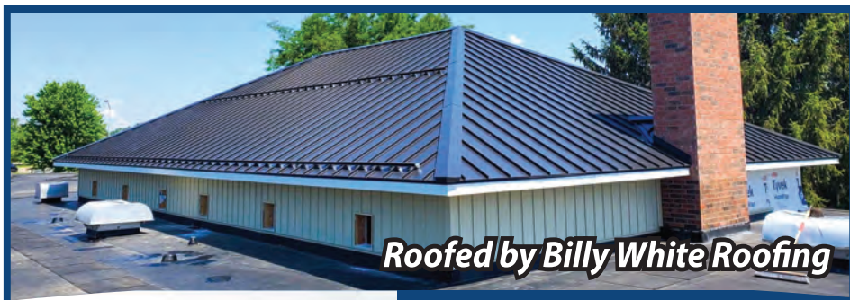
Roofed by Billy White Roofing

Sunday, Nov. 5, 4 pm “When In Rome” Sunday, Dec. 10, 4 pm “Together For the Holidays” Sunday, March 3, 4 pm “Madcat and the DCO” Sunday, May 5, 4 pm “Bicentennial Celebrations” Friday, June 14, 7 pm Gazebo Concert (Monument Park) Thursday, June 20, time TBD Dexter Bicentennial Opening Ceremony Monument Park)