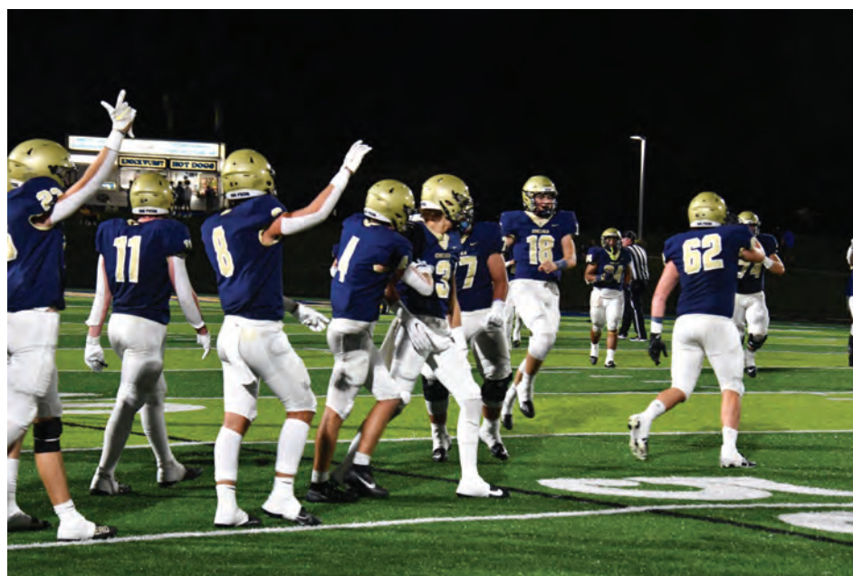
Story and another photo on page 5.