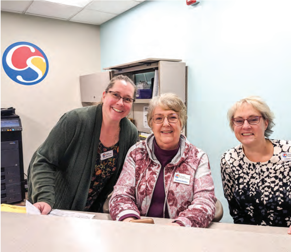
There are smiles all around as senior volunteers provide program and organizational support to local organizations.