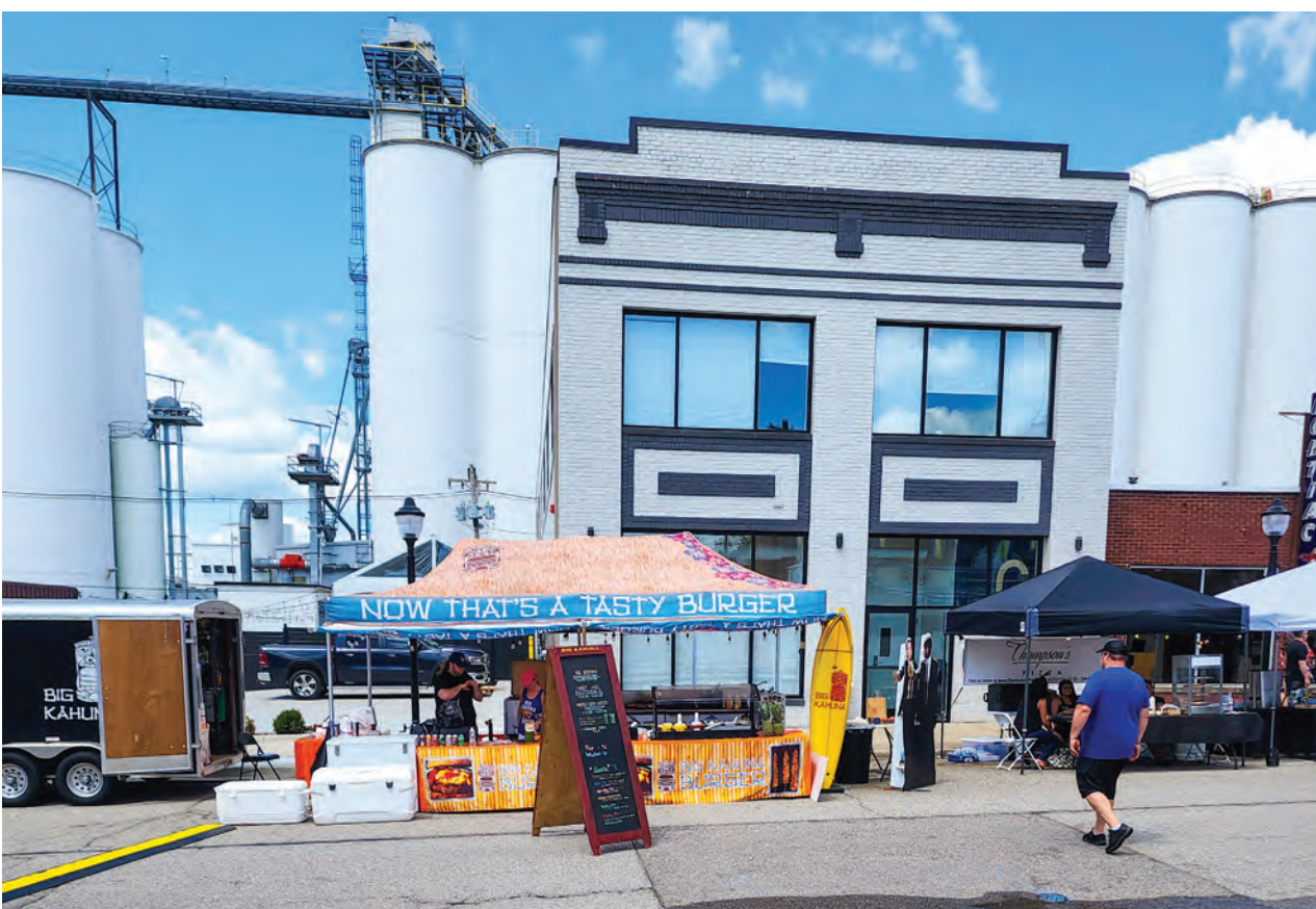
Story and more photos on page 6