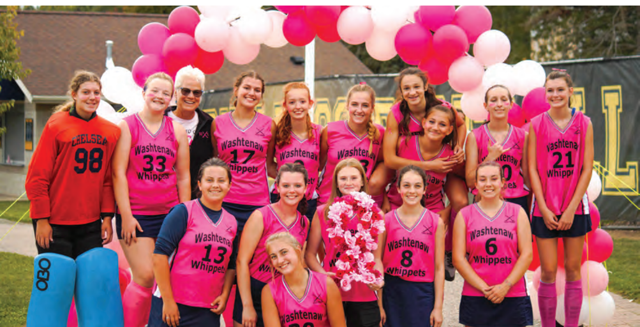
Story and another photo on page 3.