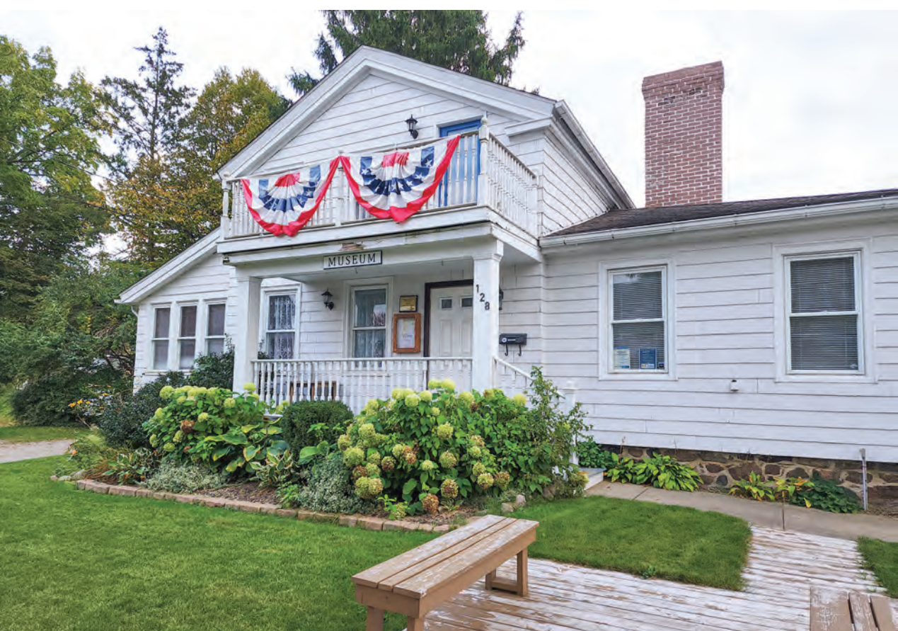
Story and more photos on page 5.

new moon neuro MICROCURRENT NEUROFEEDBACK