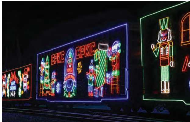
Story and more photos on page 6.