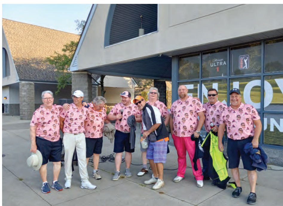
Story and more photos on page 6.