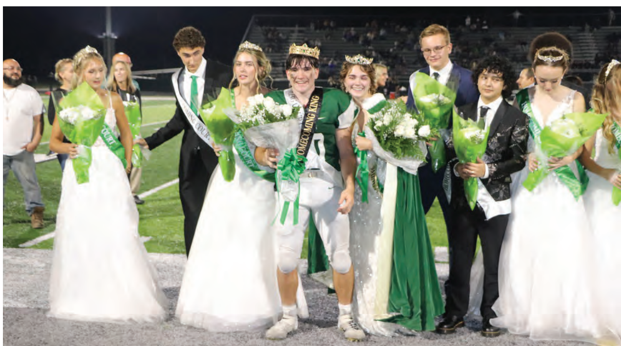
Story and more photos on page 8.