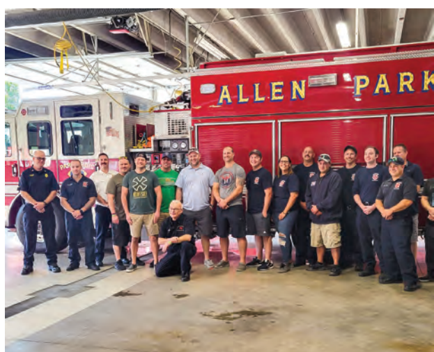
Story and more photos on page 4.